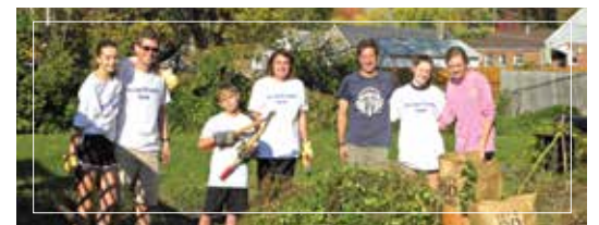
Our Lady of Lourdes parishioners volunteer on Make a Difference Day.

On May 6, University City staff accepted the award from USA Today at an awards luncheon in Washington, D.C.