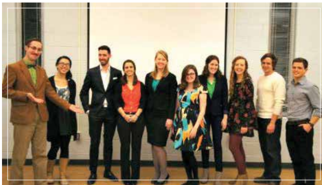
Students in Wash U’s Sam Fox School of Design and Visual Arts collaborated with the Commission on Arts & Letters.

A digital map to the sites can be found at the commission’s website, ucityartsandletters.org . With questions about the program, email the commission at ucityartsandletters@gmail.com .