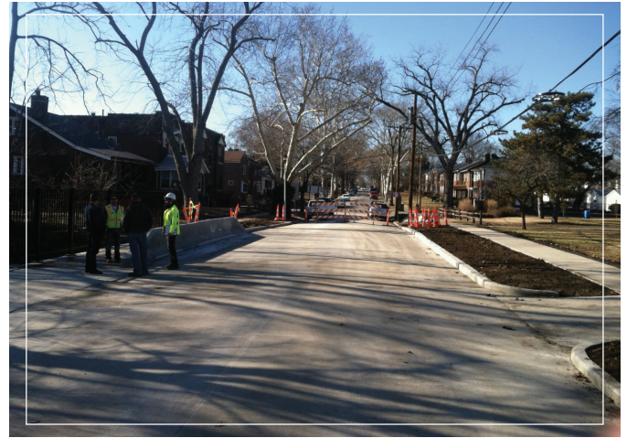
Completed Chamberlain Avenue Bridge

That day, the Chamberlain Avenue Bridge opened to traffic, less than 5 months after its closure. The new single span, pre-stressed, voided beam bridge structure provides a safe and reliable transportation connection across the River Des Peres and should not require major rehabilitation for at least 40 years. With regular preventive maintenance, this lifetime can be extended to more than 50 years.