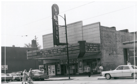
The Varsity Theatre on Delmar Boulevard

A Saturday afternoon with the latest western and a tub of popcorn, or perhaps a date night... we all have fond memories of our favorite local movie theatre. By the 1940s, University City could boast four movie theaters. The earliest theater was the Irma Theatre, later known as the U City Theatre, located at 6324 Bartmer Ave., which opened in 1922, followed soon after by the elegant and better-known Tivoli.