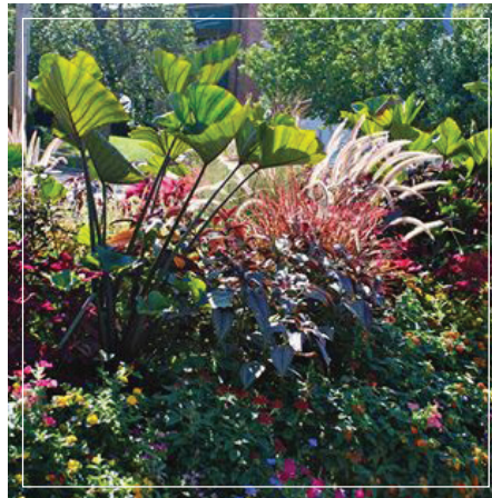
The gardens at Jackson and Pershing Avenues

For more information, visit UCB's website, www.ucityinbloom.org , and follow "U City in Bloom" on Facebook and Twitter.