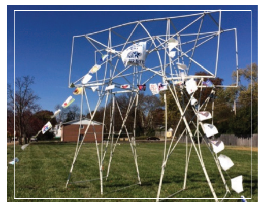
Temporary sculpture created at last fall's Better Block event