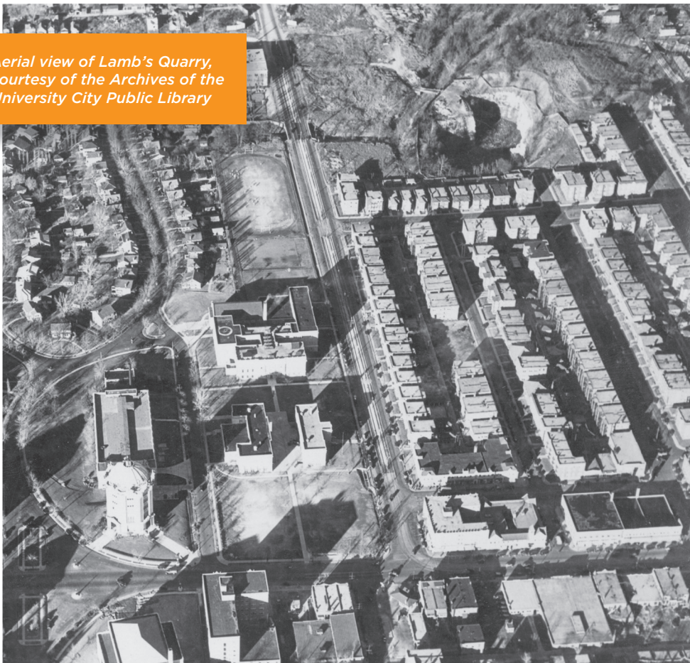
Aerial view of Lamb's Quarry

Next time you are playing catch or having a picnic in Metcalfe Park, take a moment to remember the history of the area and the progress that we have made.