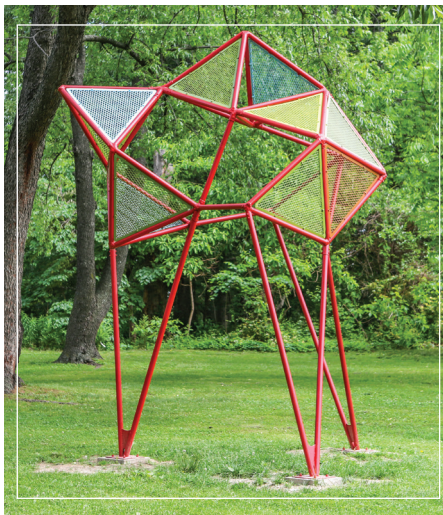
"Recollection" by Caitlin Penny

Make sure to check out these incredible pieces of artwork before the end of the series!