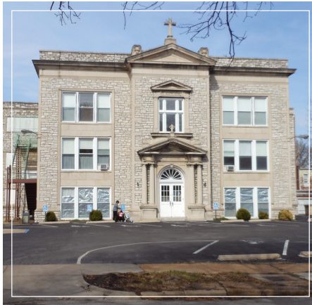
Lamb's Quarry provided the stone to build All Saints School in 1918.

Operations ceased in 1928, and the quarry was filled with water and trash. Rats thrived – and hunting