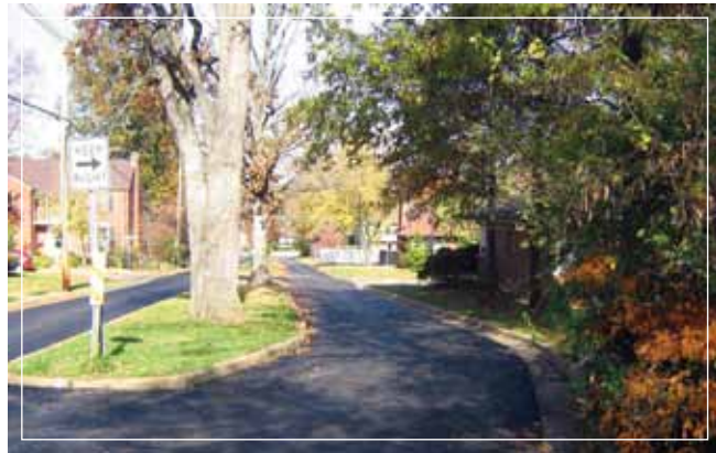
After UTBAWS application, Center Dr. between Gannon and Cornell