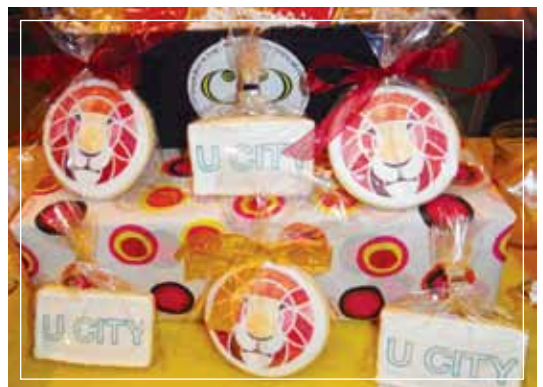
Come sample food from local University City businesses, while supporting our community on May 9.

Tickets can be purchased at the University City Library or online at www.universitycitychamber.com . Purchase your tickets by May 8 and get $5 worth of raffle tickets!