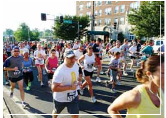
More information is available at the Library or on the race website.