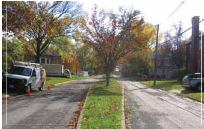
Before UTBAWS application, Center Dr. between Stanford and Amherst

This is a positive development for residents because the City can address twice the number of street blocks than it could with the traditional mill and overlay method alone. Ultrathin Bonded Asphalt Wearing Surface will be added to the City's toolbox to achieve better street conditions in our neighborhoods.