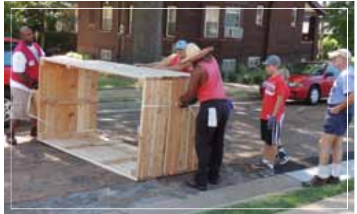
U City in Bloom would like to thank Lowe’s Hero’s and University City volunteers for helping make the Pershing Elementary garden possible.

This year, in addition to the Garden Tour, a stop will be made at Pershing Elementary School. There you will see the new community and school learning gardens that U City in Bloom, in partnership with the School District of University City and Lowe’s Stores, has installed. There are 15 raised beds (the largest of which is fully handicapped accessible) as well as an orchard of fruit trees. At 3 pm on the day of the Tour, “Grow with Lowe’s” will give kids and adults an opportunity to fill a cup with soil, plant a seed, and take it home to watch it grow. Grab a cool