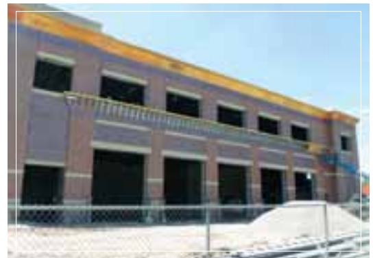
The New Engine House 1 is progressing toward completion this month.

more information on the progress of the new fire station, please contact the Fire Department at 314.505.8592 .