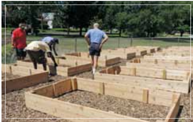
Joint school/community gardens provide beautiful landscaping for the City, as well as educational benefits for the youth.

drink and join the celebration. Neighbors are also welcome to stroll over and join.