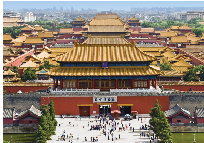
The Forbidden City, Beijing China