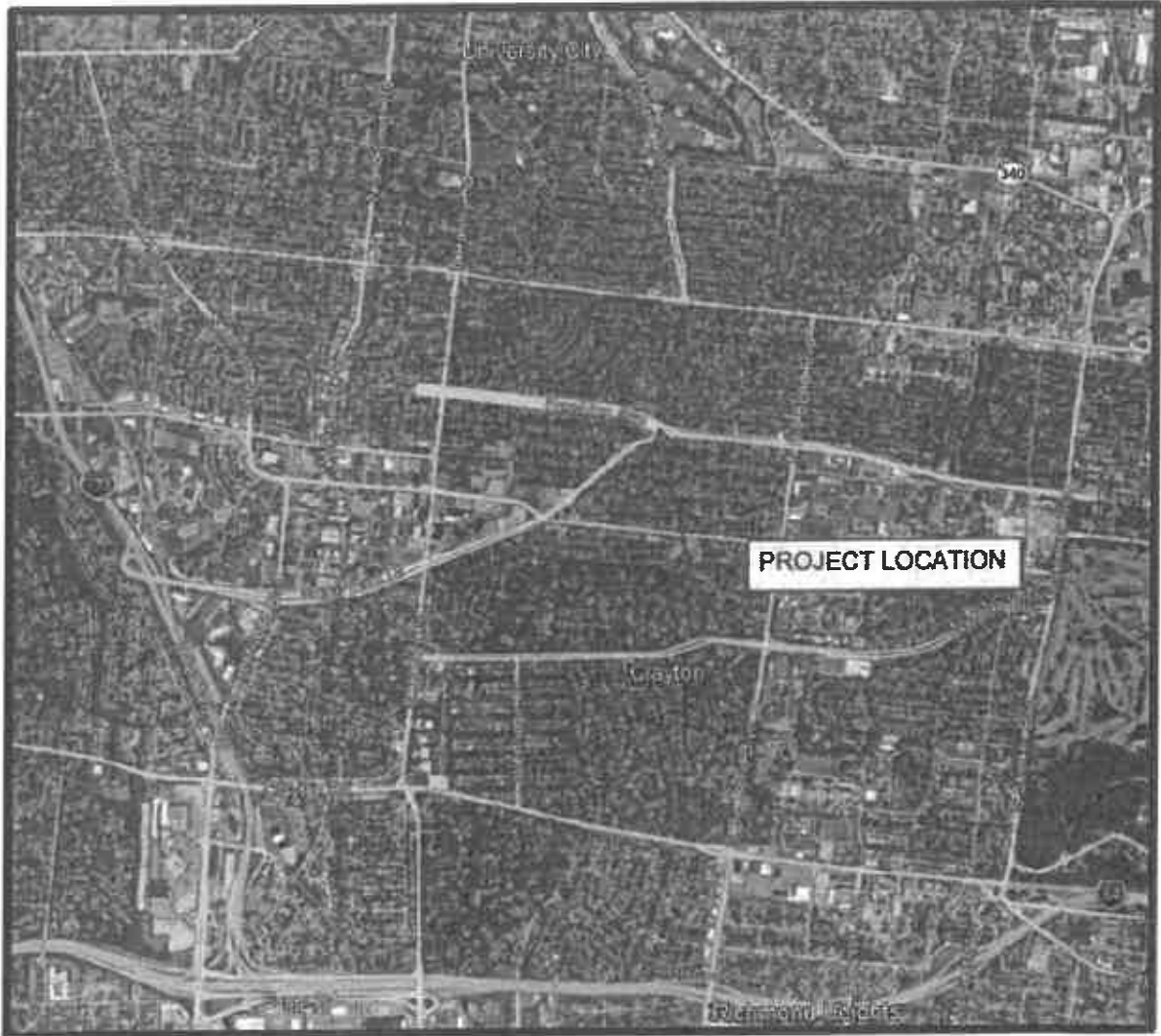
Exhibit A - Location of Project