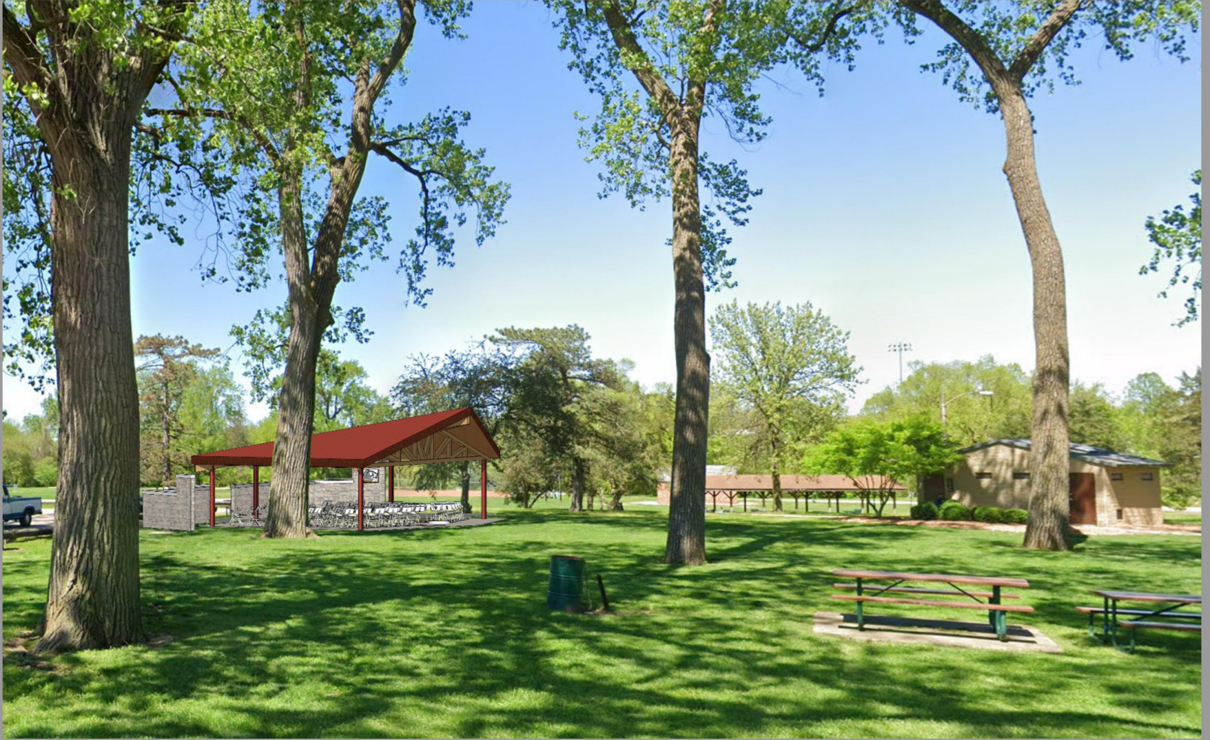
South Site Completed band shell