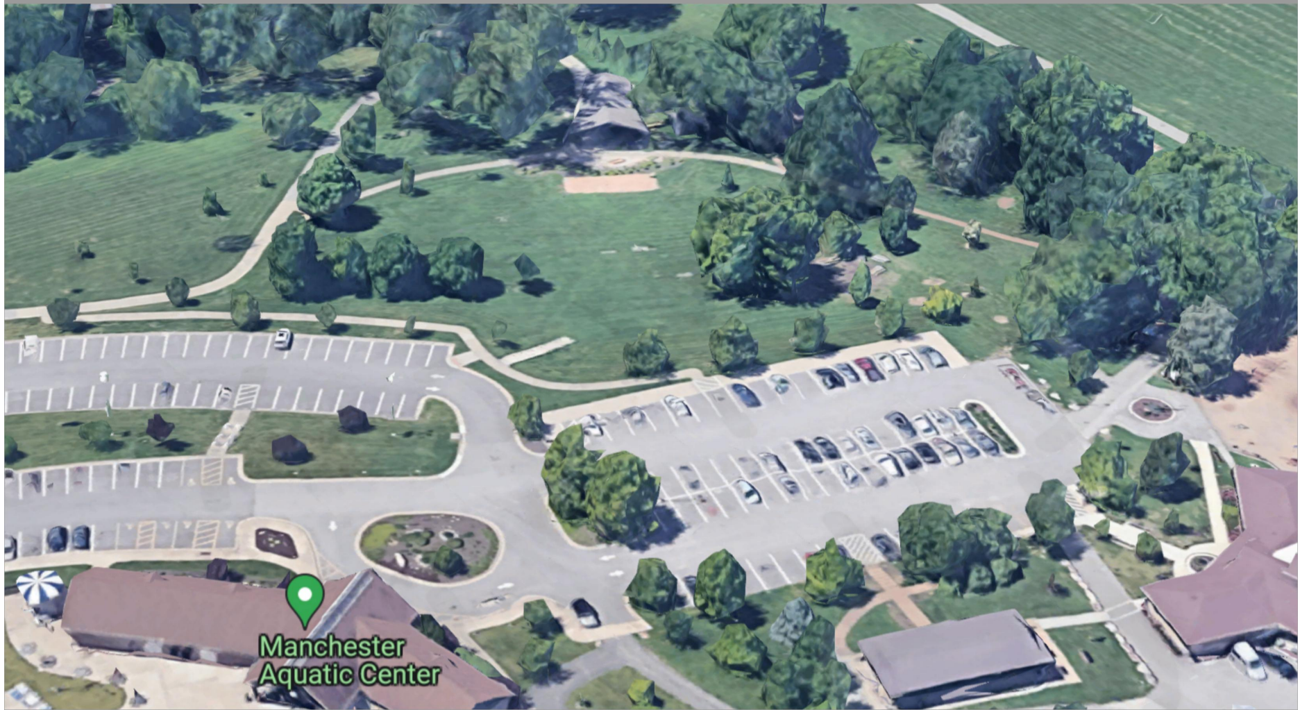
Schroeder Park, Manchester, MO – Birdseye view