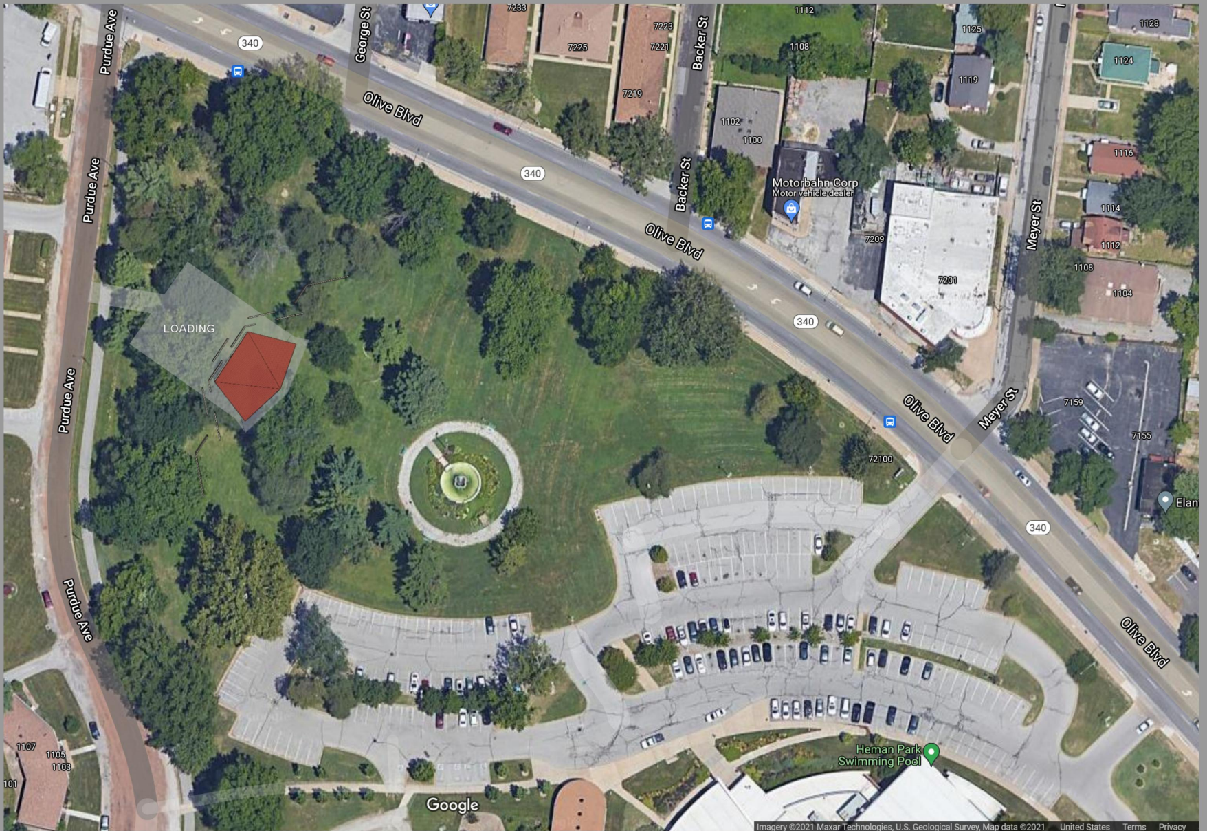
North Site - Birdseye View