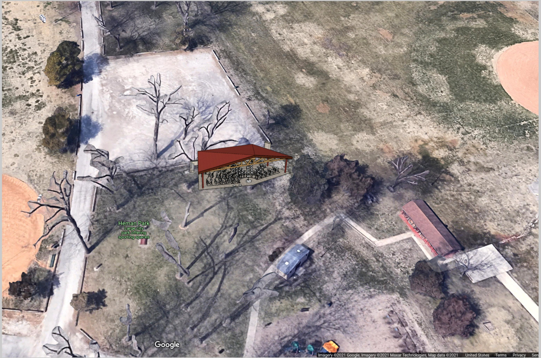
South Site - Birdseye View