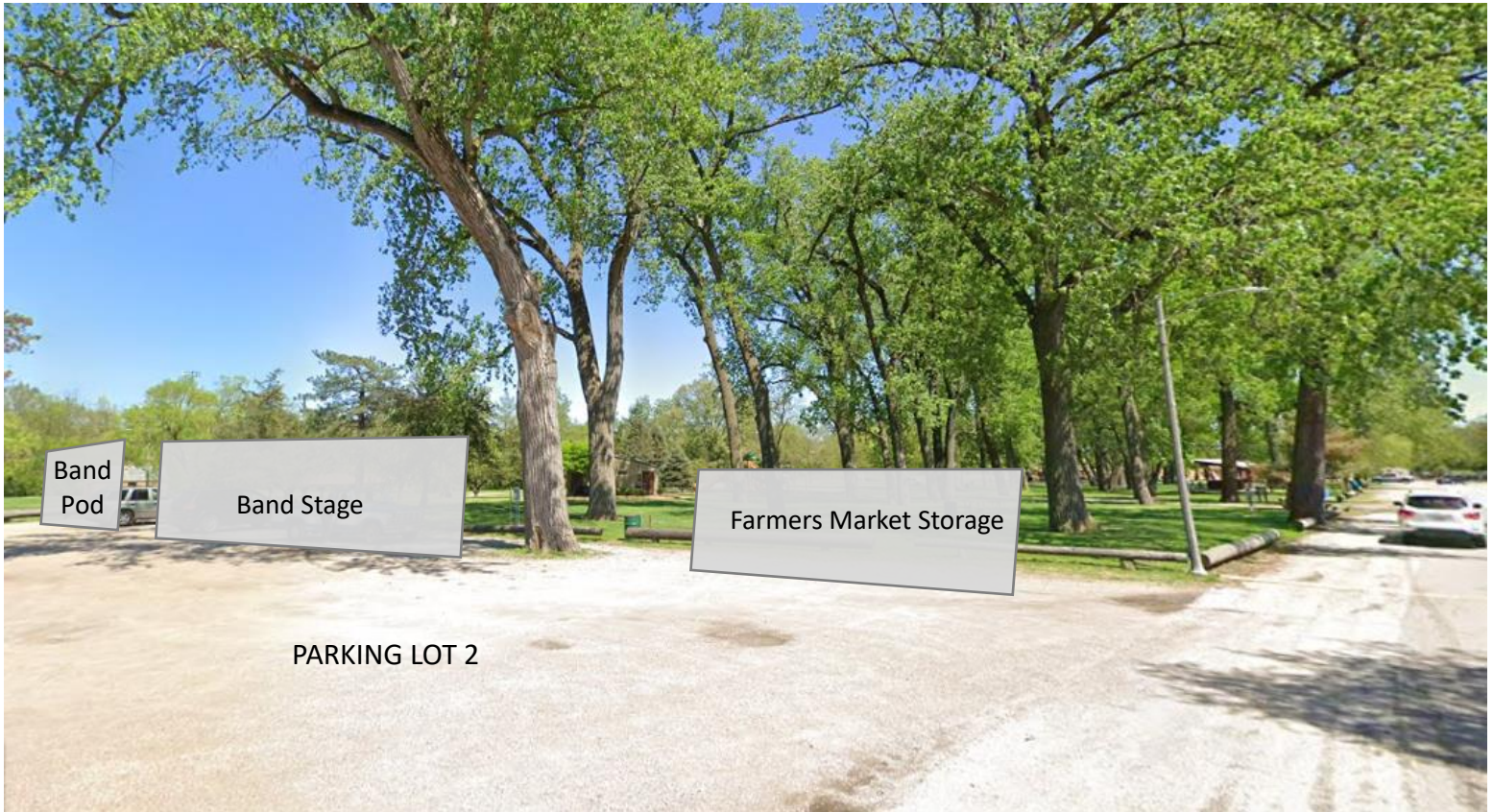
UCFM STORAGE UNIT PLACEMENT FOR 2025 SEASON HEMAN PARK AT 1028 MIDLAND BLVD