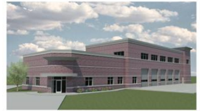
Proposed Building perspective Archimass University City Fire Department

At the November 14, 2011 City Council meeting, additional funds needed to complete the new Fire Station were approved. The new Fire Station will be built at the corner of Westgate and Vernon Avenues. The City received a $2.6 million grant from the United States Department of Homeland Security/FEMA. Construction on the new Fire Station will begin in 2012.