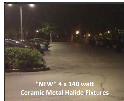
*NEW* 4 x 140 watt Ceramic Metal Halide Fixtures

In addition to energy savings, the true success is indicated in the appearance and light distribution of the new fixtures. Because of the natural color temperature of the light output, CMH light provides a much truer color representation than HPS. The pictures above show the improvement of the distribution of light and the clarity of colors with the new lights.