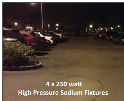
4 x 250 watt High Pressure Sodium Fixtures

These savings amount to a 41% reduction in energy and reduced maintenance/labor costs based on the longer life of the bulbs. The overall cost of operating these lights will reduce by 31% per year .