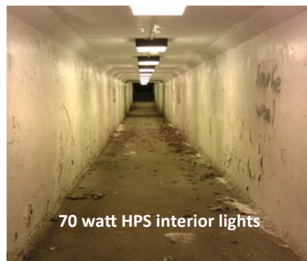
70 watt HPS interior lights

The true success is indicated in the appearance of the new fixtures. The pictures below show that although the energy use has decreased, the light output is brighter and more evenly distributed with the new lights.