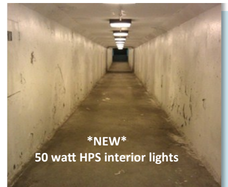
*NEW* 50 watt HPS interior lights

In addition to the new lights, the tunnel is scheduled to be painted in the near future.