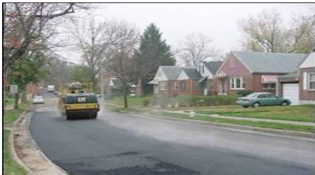
Image- Contractor resurfacing a street in University City.

Asphalt Overlays: These projects improve the street pavement surface by cold milling the surface wearing course for an approximate depth of 2 inch, repairing any asphalt or concrete pavement bases and overlaying the repaired bases with a 2 inch thick asphalt surface course.