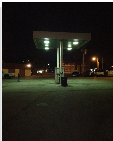
4 x 400 watt Metal Halide fixtures

These savings amount to a 74% reduction in energy which equals $453 energy savings/year. The overall cost of operating these lights will reduce by 62%, or $417 savings per year.