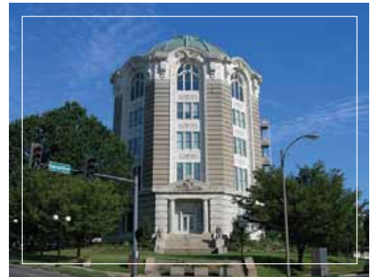
Built in 1903 as the headquarters of Women's Magazine, the University City Hall building is now on the National Register of Historic Places.

University City is a vibrant hub of 35,000 interesting people, places and activities. We hope this newsletter will help you stay connected.